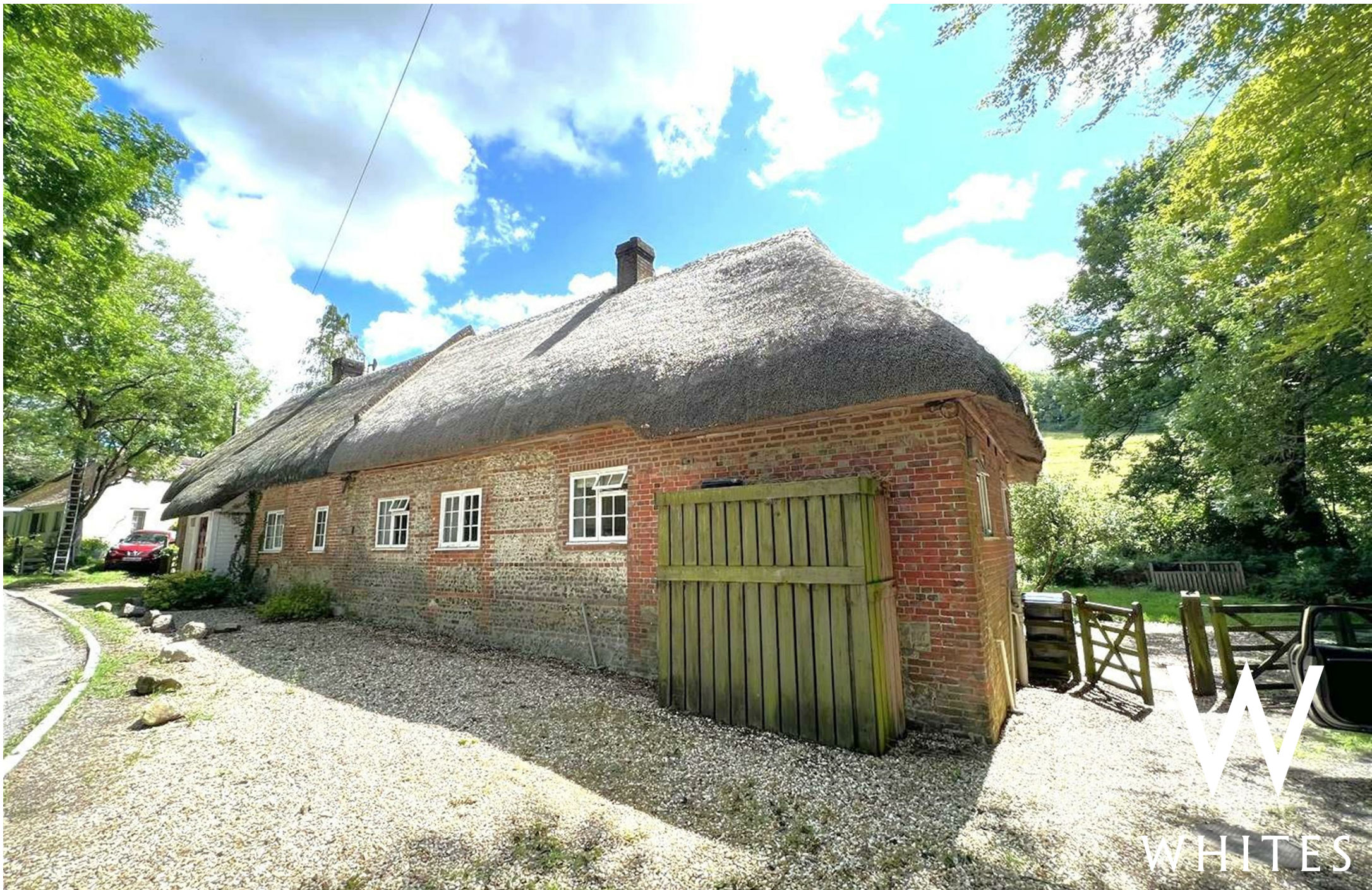
2 Vine Cottages, Handley Street, Ebbesbourne Wake, Salisbury, Wiltshire, SP5